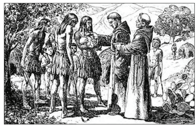
The first recorded baptisms in Alta California were performed at Los Cristianitos, "The Canyon of the Little Christians", in what is now San Diego County, just south of Mission San Juan Capistrano.

...to the History of the Catholic Faith in the Americas Conference.